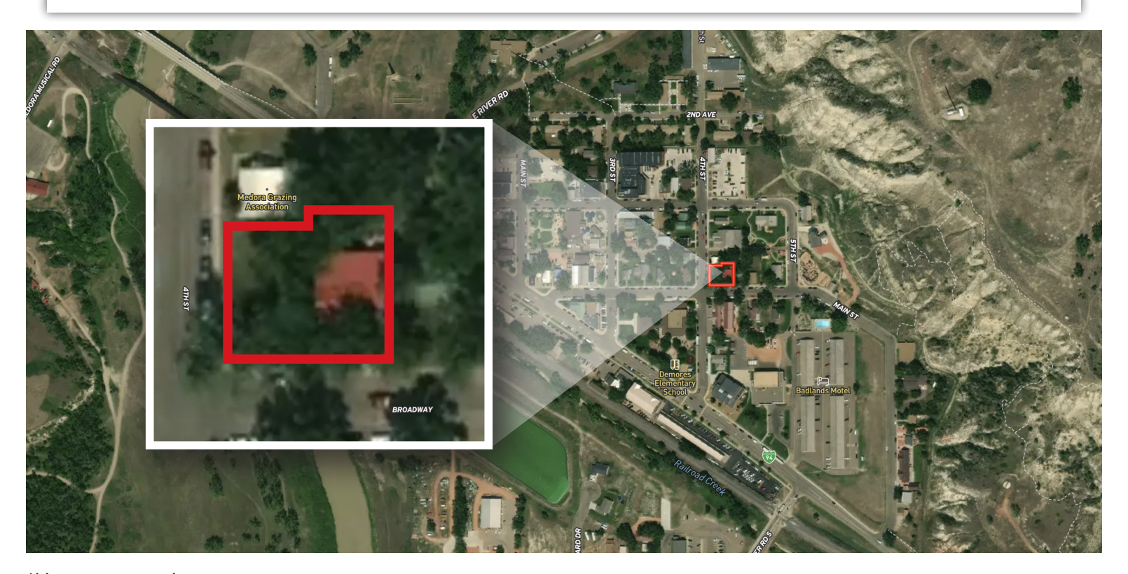
*Lines are approximate

Please Note: Storage shed in the backyard to be removed prior to real estate closing.