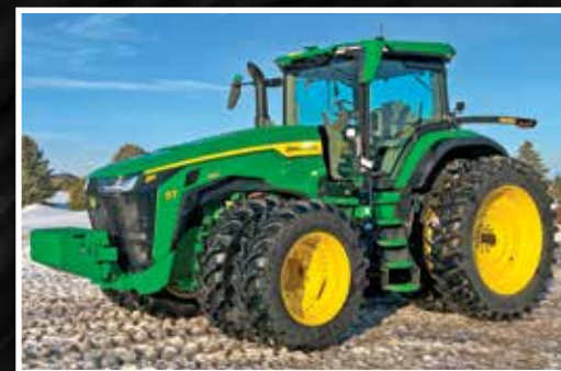
2023 JOHN DEERE 8R 340 / 822 HRS.