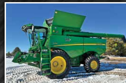
2022 JOHN DEERE S770 / 1,248 SEP.