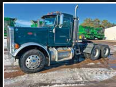
2006 PETERBILT 379