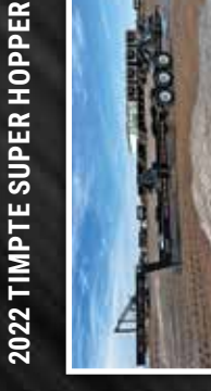
2022 TIMPTE SUPER HOPPER