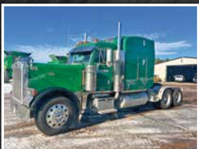
2001 PETERBILT 379