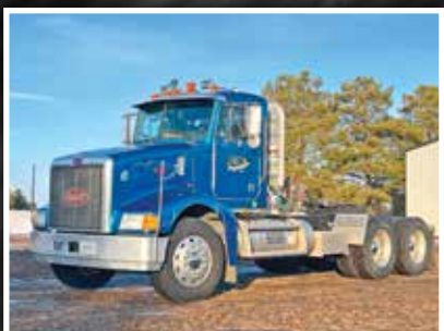
2000 PETERBILT 385