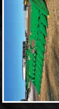
2022 MACDON FD240