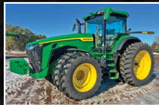
2023 JOHN DEERE 8R 340 / 744 HRS.