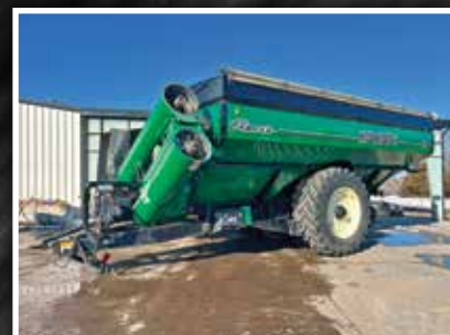
2020 ELMERS 1100