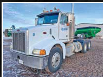
2004 PETERBILT 385