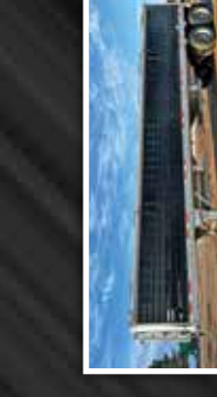
2022 TIMPTE SUPER HOPPER