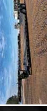
2012 BWS MFG.