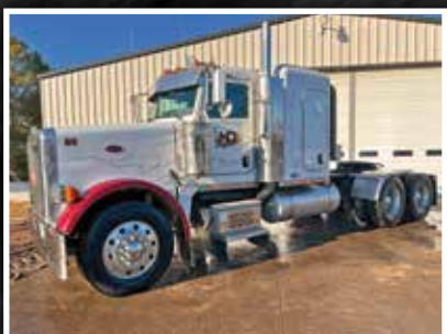
2007 PETERBILT 378 / 1,157,002 MI.