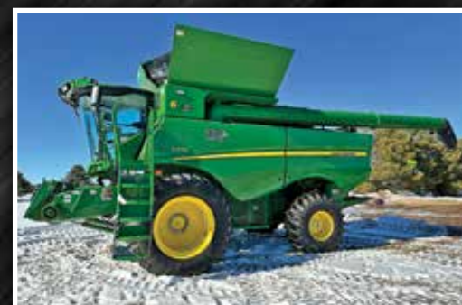
2022 JOHN DEERE S770 / 1,165 SEP.