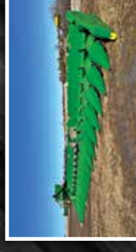
2022 MACDON FD240