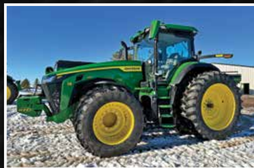
2023 JOHN DEERE 8R 340 / 711 HRS.

CLOSES: THURSDAY, APRIL 11 | 12PM CDT 2024