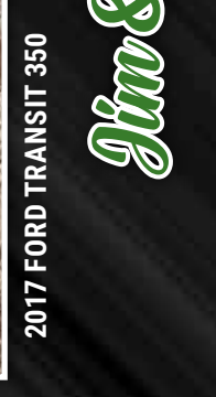
2017 FORD TRANSIT 350