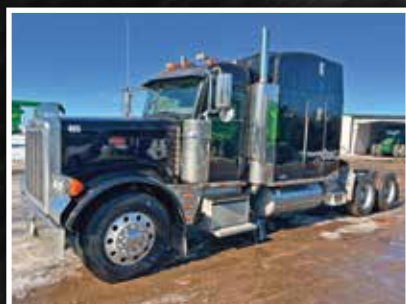
2007 PETERBILT 379 / 1,135,198 MI.