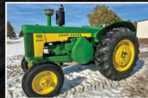
1959 JOHN DEERE 830