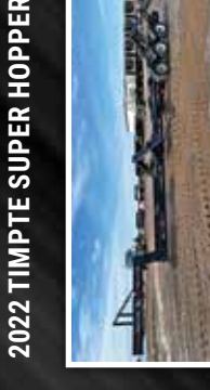
2022 TIMPTE SUPER HOPPER