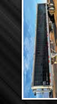
2021 TIMPTE SUPER HOPPER