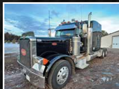
2007 PETERBILT 379 / 264,531 MI.