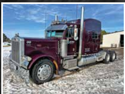
2004 PETERBILT 379