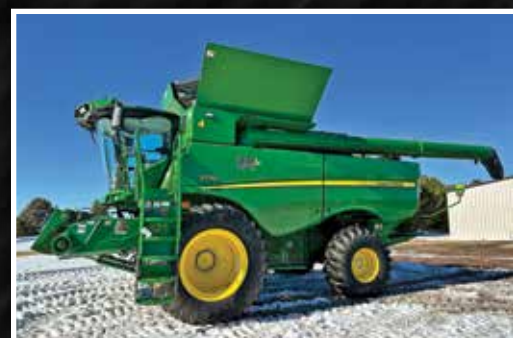
2023 JOHN DEERE S770 / 730 SEP.