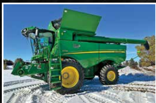
2023 JOHN DEERE S770 / 674 SEP.