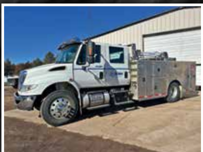
2011 INTERNATIONAL 4400