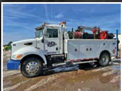
2013 PETERBILT 337