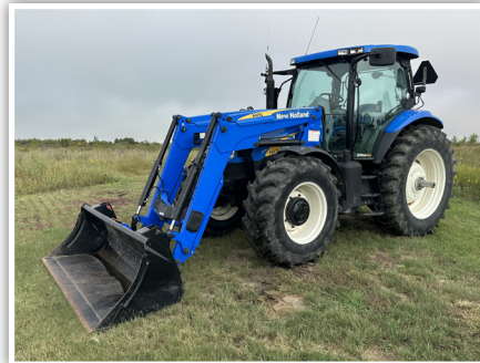
2010 NEW HOLLAND T6070 ELITE