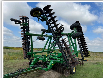
JOHN DEERE 637