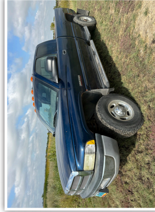
2001 DODGE RAM 2500