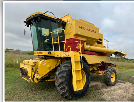
1992 NEW HOLLAND TR96