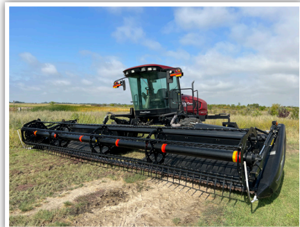
2014 MACDON M155