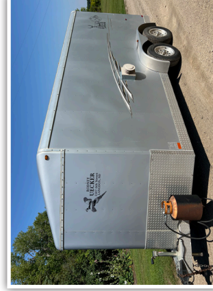
2009 JUNCTION RC INC