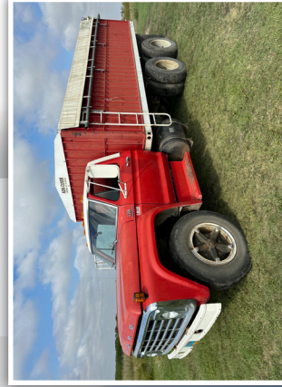
1976 FORD F750 CUSTOM