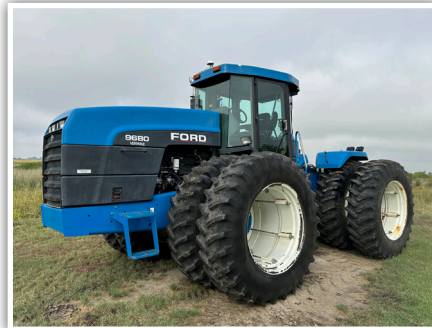
1995 FORD VERSATILE 9680