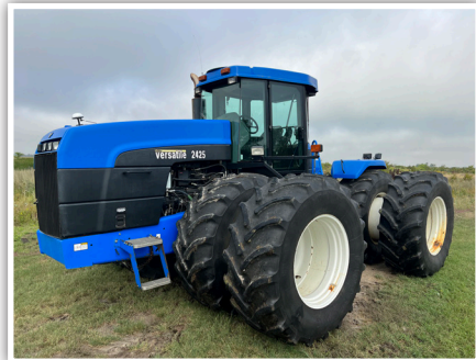
2002 BUHLER VERSATILE 2425