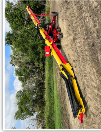
2017 WESTFIELD WCX1545FL