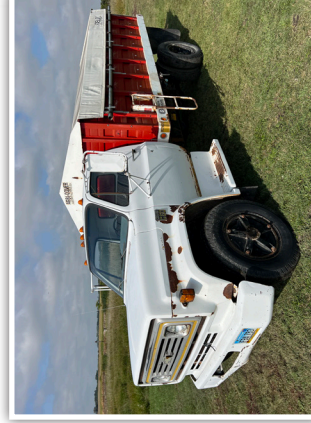
1974 CHEVROLET C60