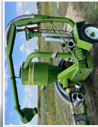
WALINGA 510STD AGRI VAC

PRESORTED STANDARD US POSTAGE PAID Permit #315 FARGO, ND