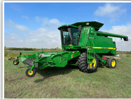
1998 JOHN DEERE 9610 MAXIMIZER