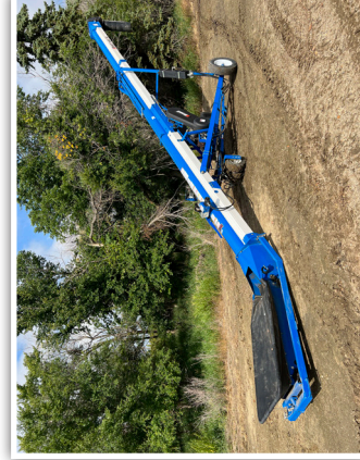
2014 BRANDT GRAIN BELT 1545