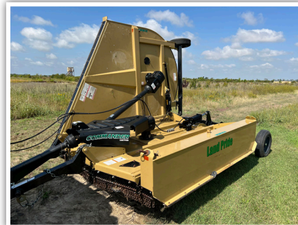
LAND PRIDE COMMANDER RCM5014