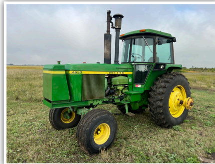
1977 JOHN DEERE 4630