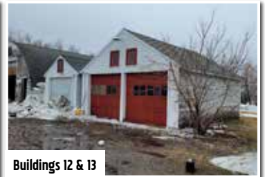
Buildings 12 &amp; 13

House: Rural Water, (3) Bedrooms, (1) Bathrooms, Basement, Septic, Electric/Oil Heat