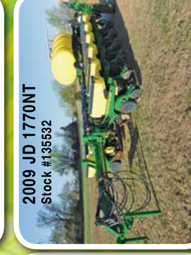
2009 JD 1770NT Stock #135532