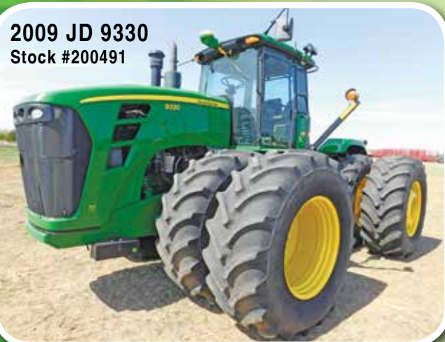
2009 JD 9330 Stock #200491