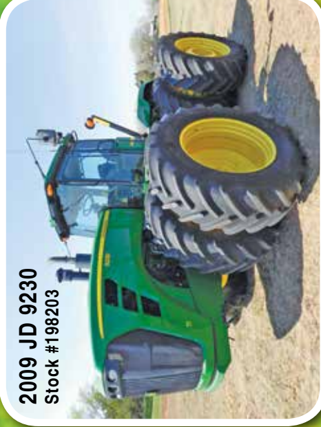
2009 JD 9230 Stock #198203