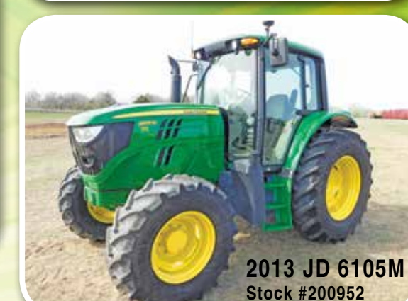
2013 JD 6105M Stock #200952