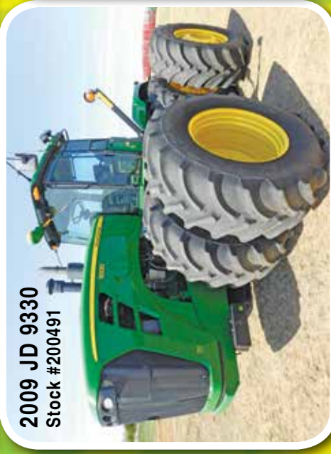
2009 JD 9330 Stock #200491