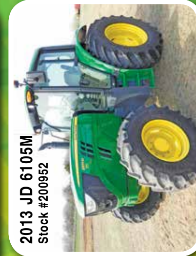
2013 JD 6105M Stock #200982