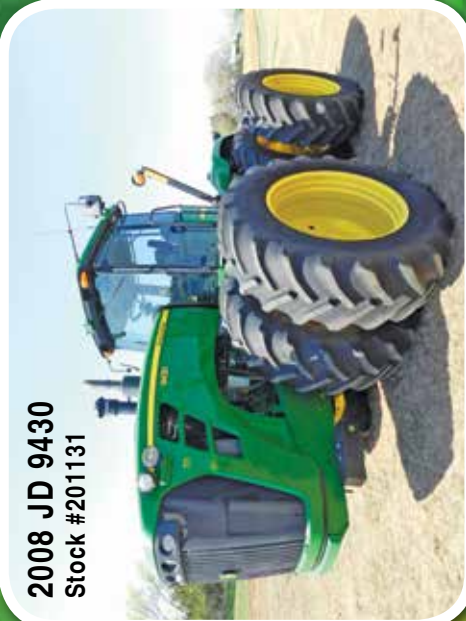
2008 JD 9430 Stock #201131