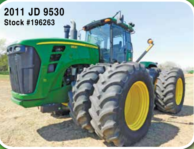
2011 JD 9530 Stock #196263

Some restrictions may apply. See P&K Equipment for details. These rates are only good in Enid, OK.