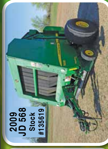
2009 JD 568 Stock #135619

PRESORTED FIRST CLASS US POSTAGE PAID Permit #315 FARGO, ND