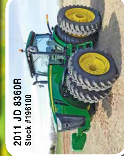
2011 JD 8360R Stock #196100