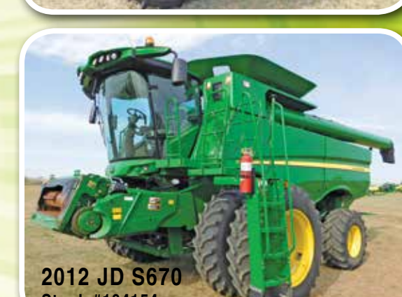
2012 JD S670 Stock #104154