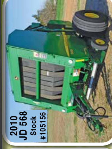
2010 JD 568 Stock #105156