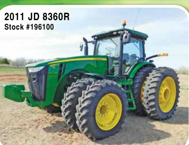
2011 JD 8360R Stock #196100