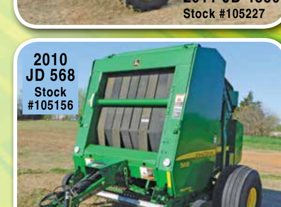
2010 JD 568 Stock #105156