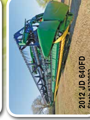
2012 JD 640FD Stock #129932