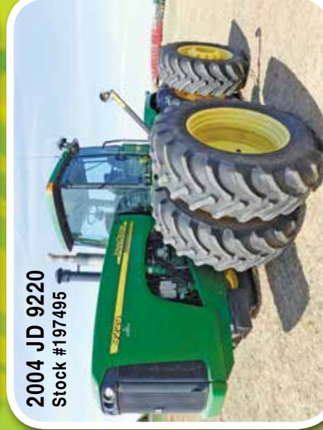
2004 JD 9220 Stock #197495