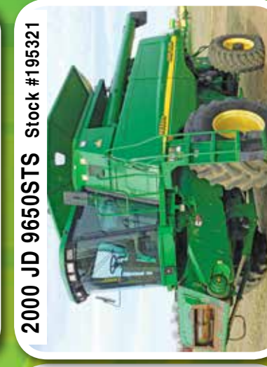
2000 JD 9650STS Stock #195321