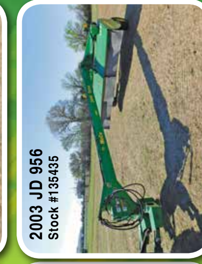
2003 JD 956 Stock #135435