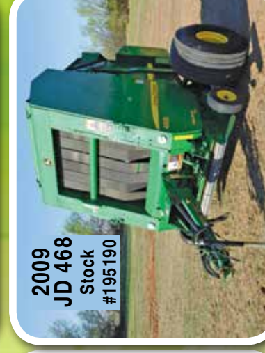
2009 JD 468 Stock #195190