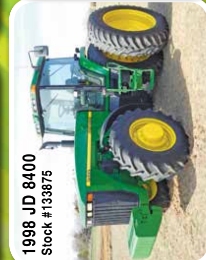
1998 JD 8400 Stock #133875