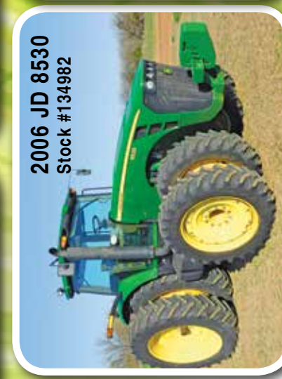
2006 JD 8530 Stock #134982