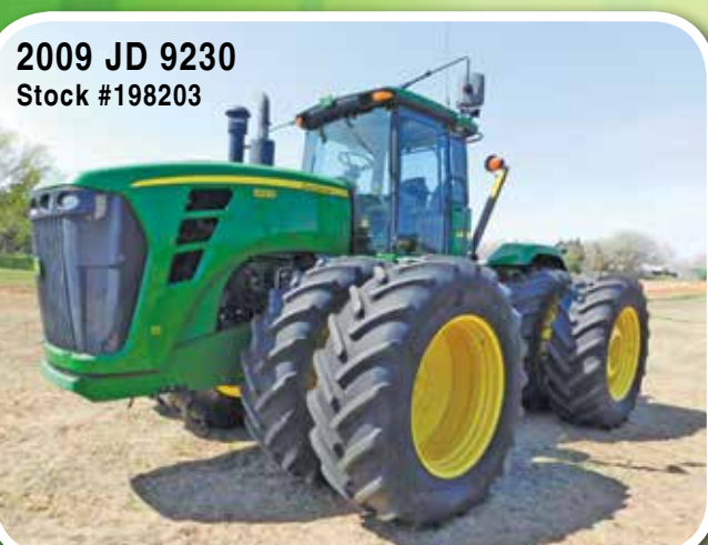
2009 JD 9230 Stock #198203