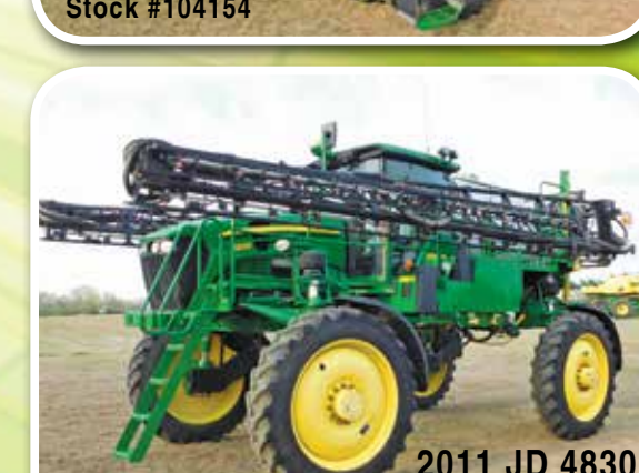
2011 JD 4830 Stock #105227