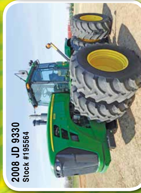
2008 JD 9330 Stock #195564