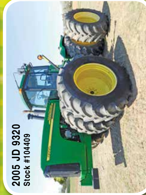
2005 JD 9320 Stock #104409