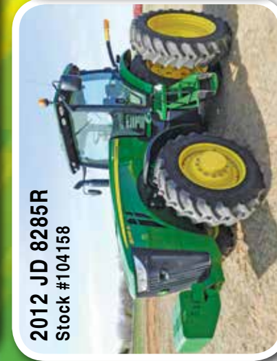
2012 JD 8285R Stock #104158