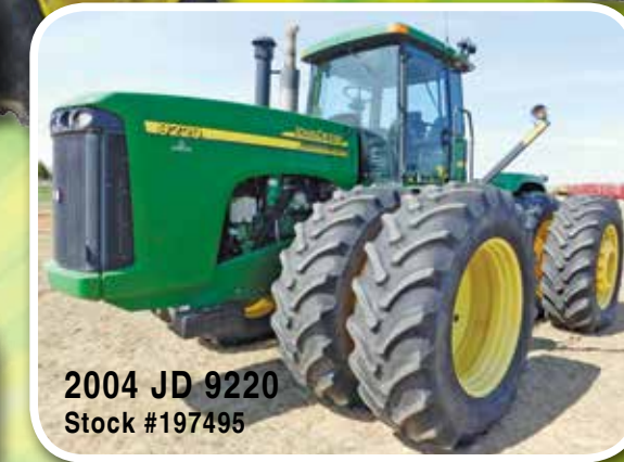
2004 JD 9220 Stock #197495

2003 JD 956, disc mower, 14-1/2", 2 pt., 1000 PTO, V-line impeller conditioner, hydro swing, hydraulic deck pitch leveling, S/N E00956T174137, Stock #135435