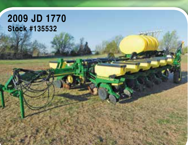
2009 JD 1770 Stock #135532