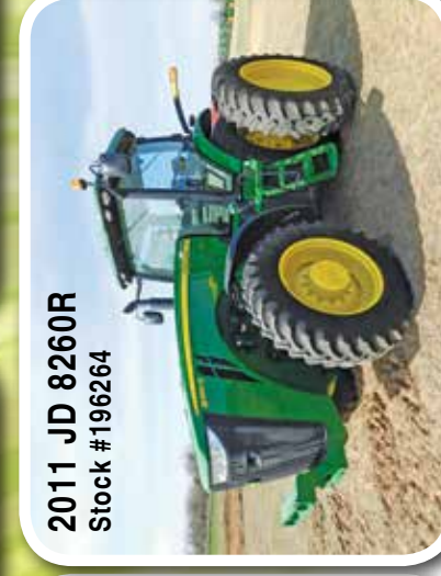
2011 JD 8260R Stock #196264