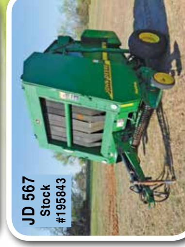
JD 567 Stock #195843