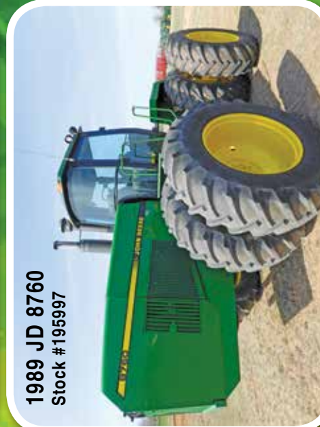
1989 JD 8760 Stock #195997