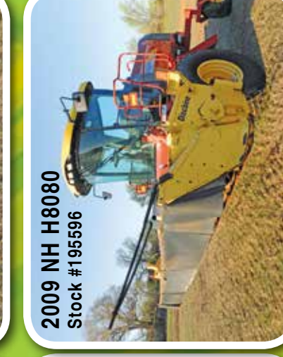
2009 NH H8080 Stock #195596