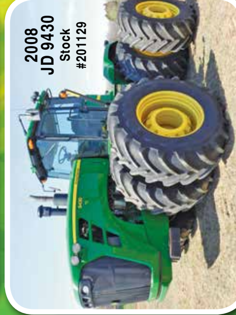
2008 JD 9430 Stock #201129