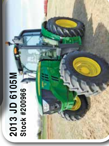
2013 JD 6105M Stock #200966