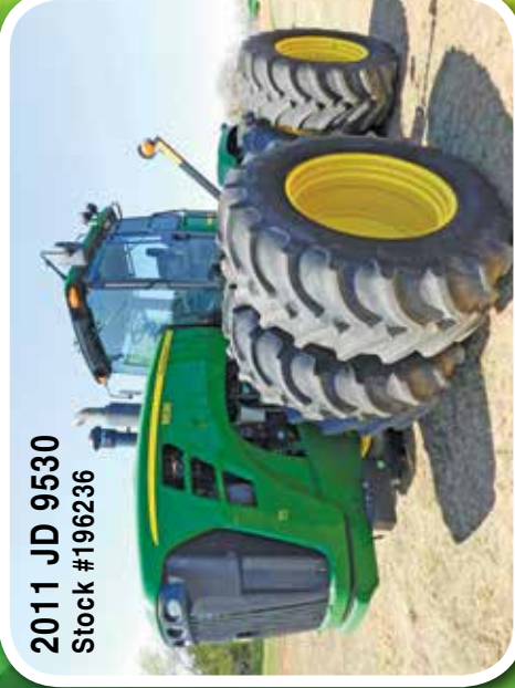
2011 JD 9530 Stock #196236

EQUIPMENT LOCATION: P&K Equipment 4121 N Hwy 81 Bypass, Enid, OK 73701