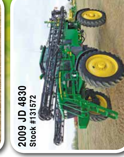
2009 JD 4830 Stock #131572