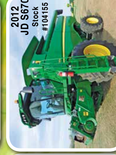
2012 JD S670 Stock #104155