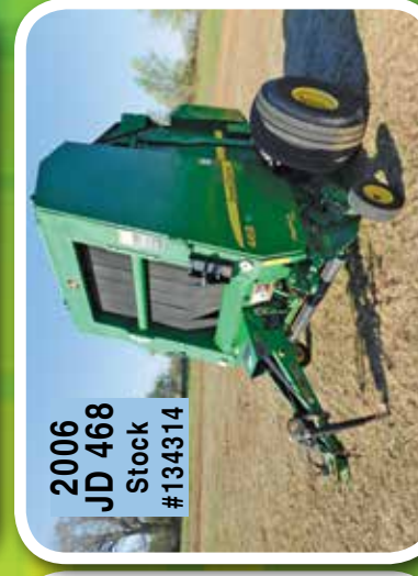
2006 JD 468 Stock #134314