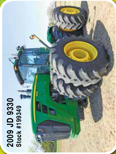
2009 JD 9330 Stock #199349