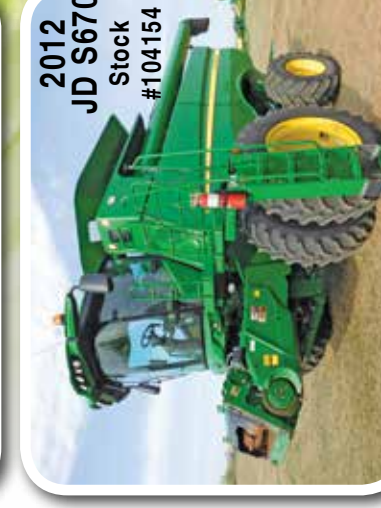
2012 JD S670 Stock #104154