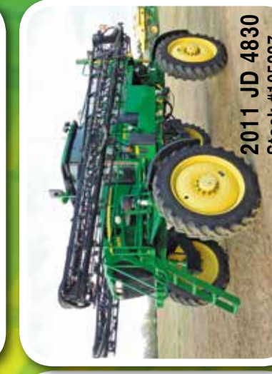
2011 JD 4830 Stock #105227