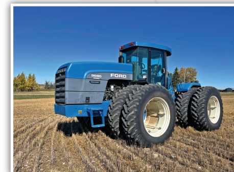
1995 FORD NEW HOLLAND 9680