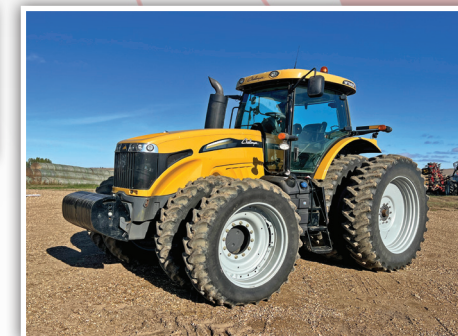
2014 CAT CHALLENGER MT685D

1971 Caterpillar 120 , motor grader, AWD, 14' moldboard, 14.00-24 tires, S/N10R1858 Land Pride FD2572 , finishing mower, 72", 3 pt., 540 PTO, S/N L88247 Midland box , 18'x95"x58" PARTS & FARM SUPPORT ITEMS MacDon , asst. guards MD118344/MD118345, hold down clamps, nuts & bolts SwathMaster pickup , 13', 7-belt, parts only