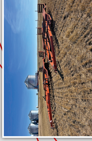
(2) 1977 DONAHUE 1050XL

Teron Farms Inc. & Paulson Brothers Farm Equipment