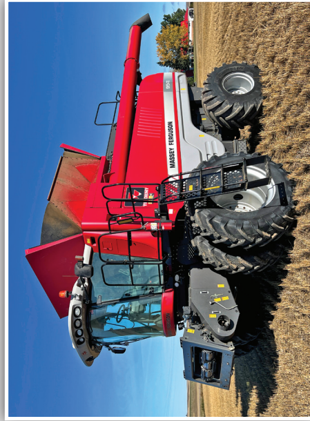
2013 MASSEY FERGUSON 9540

PRESORTED STANDARD US POSTAGE PAID Permit #315 FARGO, ND