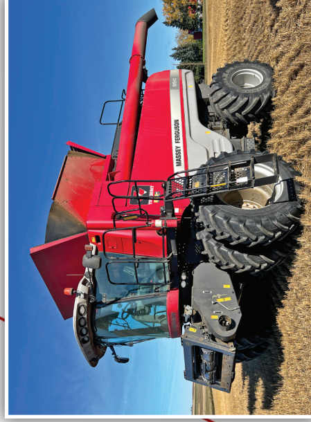
2013 MASSEY FERGUSON 9540