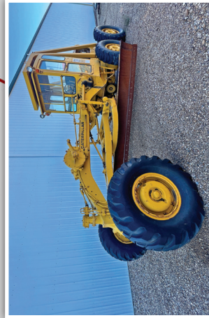
1971 CATERPILLAR 120