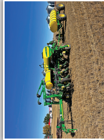
2005 JOHN DEERE 1770NIT