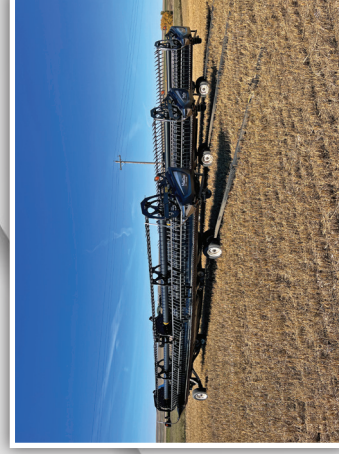
(3) 2014 MACDON FD75