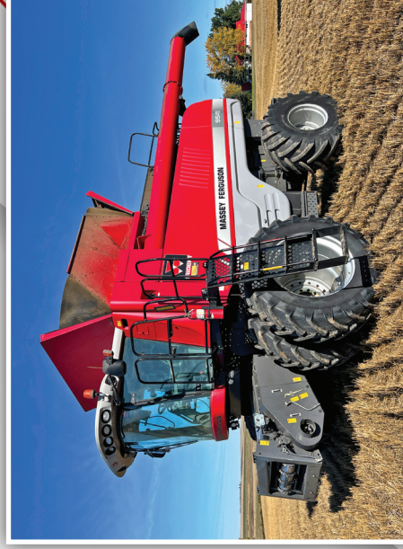
2013 MASSEY FERGUSON 9540