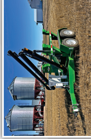
HITCH DOC HSC2000