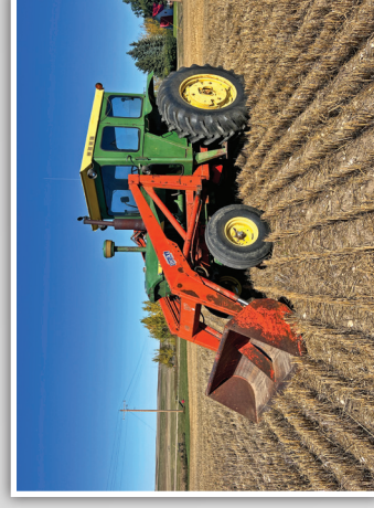
1967 JOHN DEERE 4020