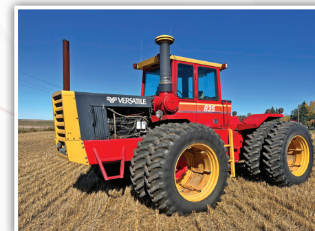
1983 VERSATILE 835