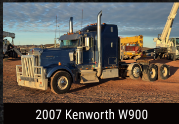
2007 Kenworth W900