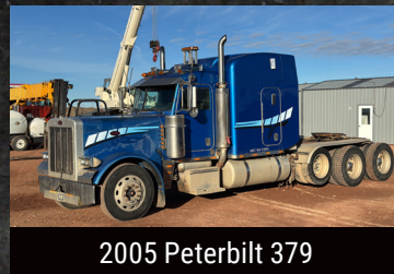
2005 Peterbilt 379