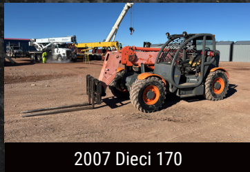
2007 Dieci 170