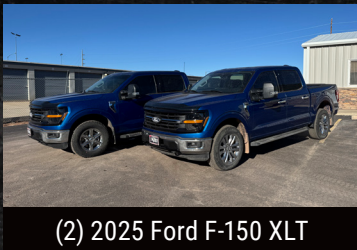
(2) 2025 Ford F-150 XLT