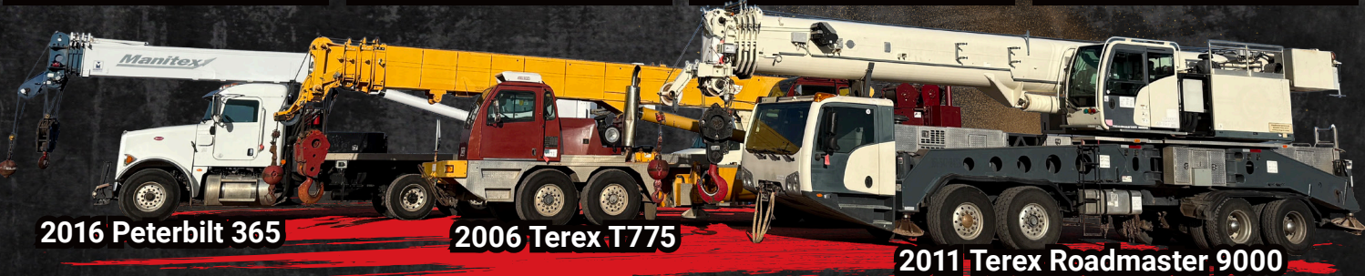
2016 Peterbilt 365