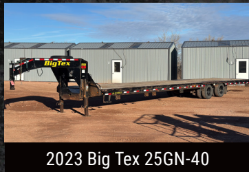
2023 Big Tex 25GN-40