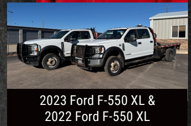
2023 Ford F-550 XL & 2022 Ford F-550 XL