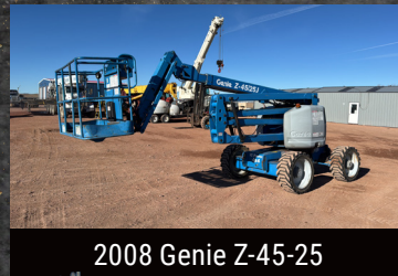
2008 Genie Z-45-25