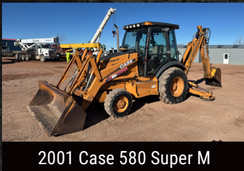
2001 Case 580 Super M