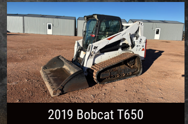
2019 Bobcat T650