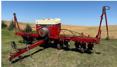
International 800 Cyclo