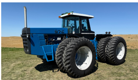
1990 Ford Versatile 976 Designation 6