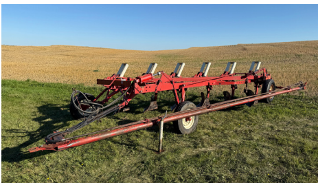
(2) International 770