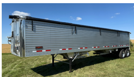
2016 Timppe Super Hopper