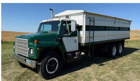
1981 International S1854