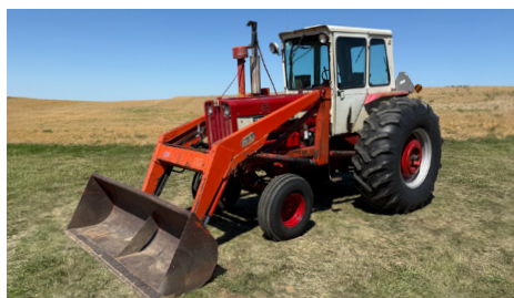
1966 International 806