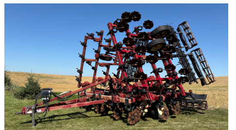
2012 Salford 570 RTS