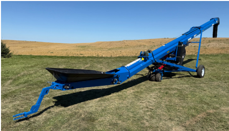
2020 Brandt 1547LP+