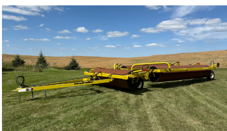
2012 Degelman 7645