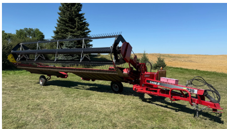
Case IH 8220