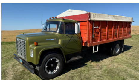
1974 International 1600