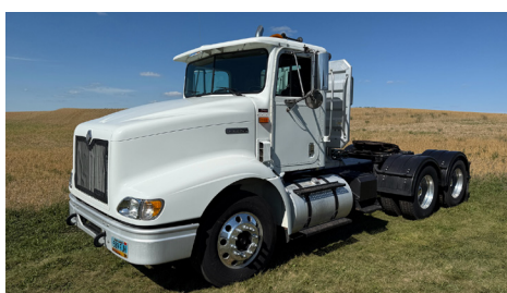
1999 International 9100