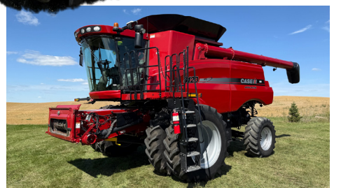
2011 Case IH 8120