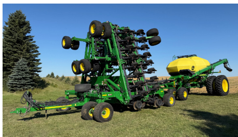
2014 John Deere 1890