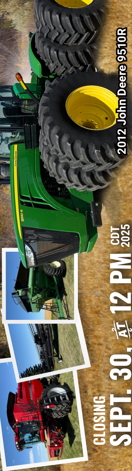
2012 John Deere 9510R