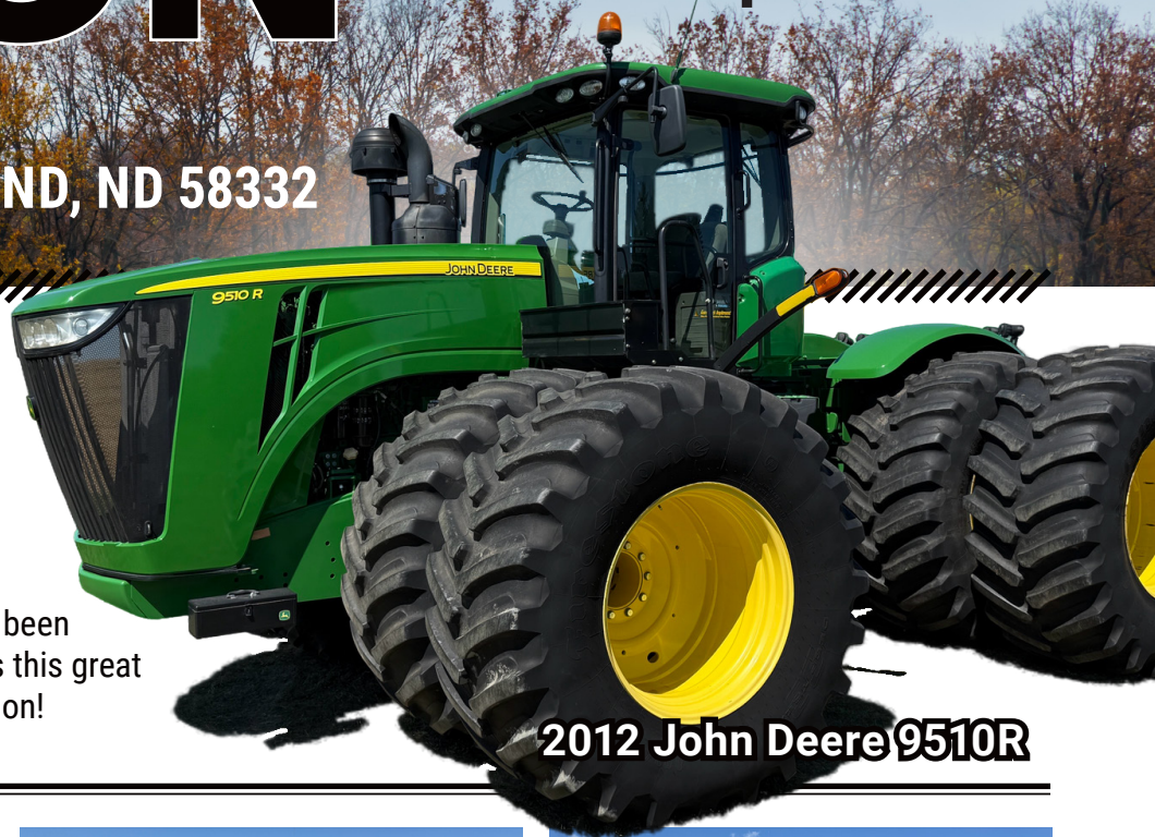
2012 John Deere 9510R