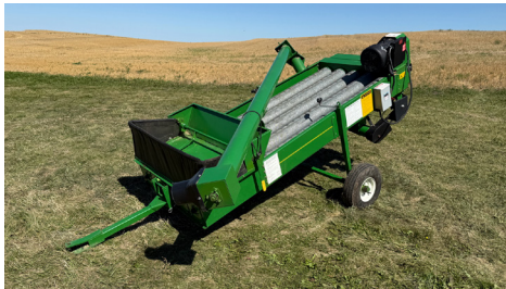
Kwik Kleen 572