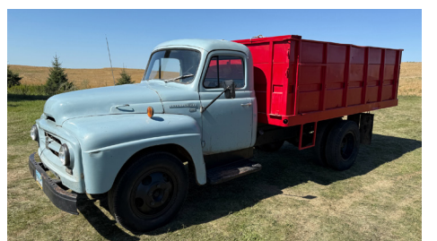
1955 International R-160