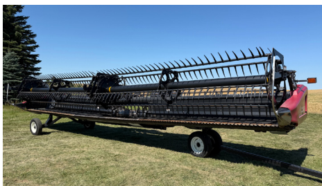
2011 Case IH 2162