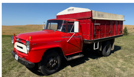
1958 International A160