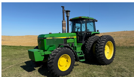
1998 John Deere 4650