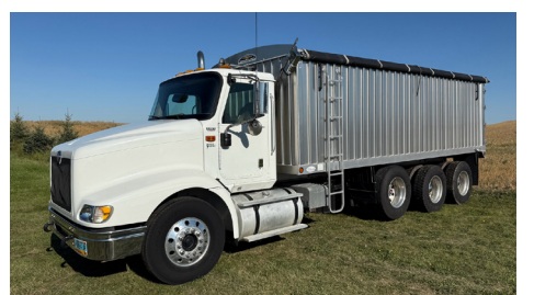
2003 International 9200i