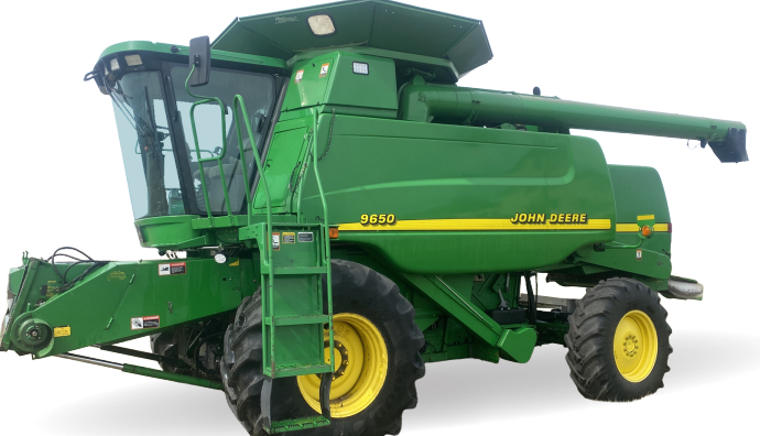
2000 JOHN DEERE 9650W