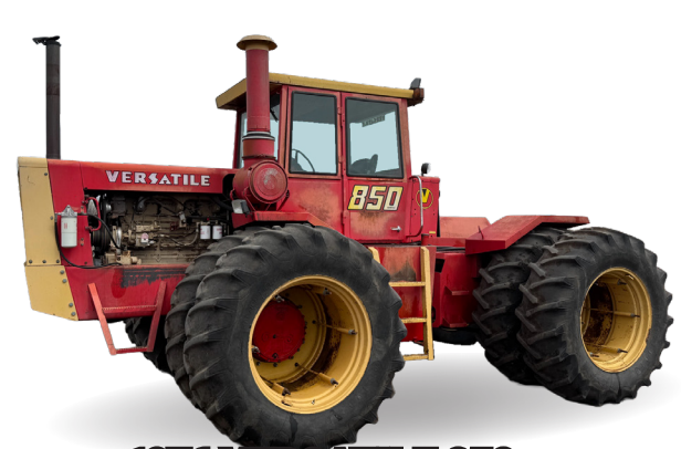
1976 VERSATILE 850

LOADOUT: Steffes will assist with loadout on June 18 until 5:30 PM & June 19 from 9 AM – 5:30 PM. By appointment only after June 19. ALL ITEMS MUST BE REMOVED BY JUNE 28 - NO EXCEPTIONS!