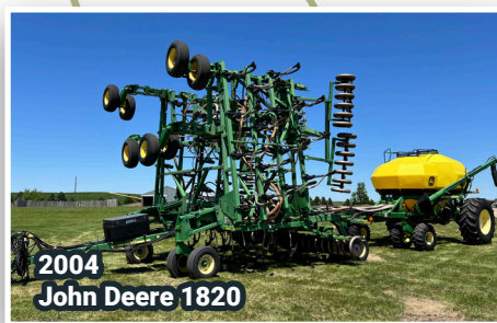
2004 John Deere 1820