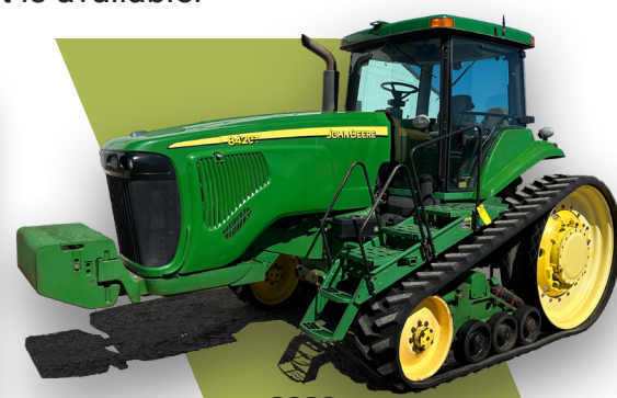
2002 John Deere 8420T