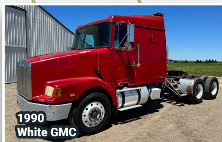
1990 White GMC