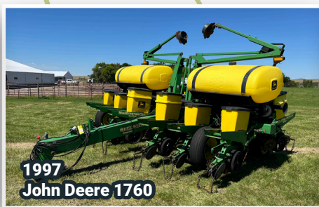
1997 John Deere 1760