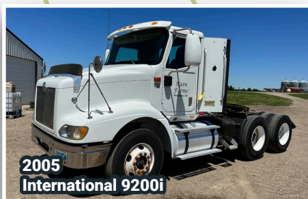
2005 International 9200i