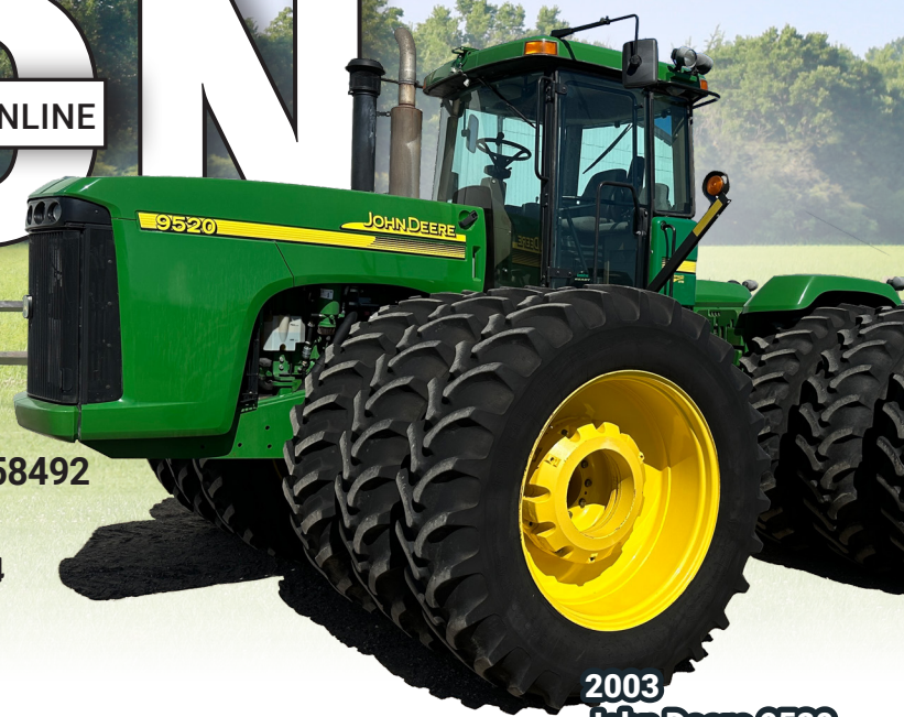
2003 John Deere 9520

LOADOUT: Monday, August 12 – Monday, August 19 weekdays from 8AM - 5PM. No weekend loadout is available.