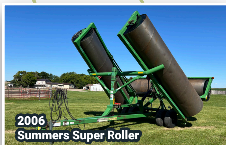
2006 Summers Super Roller