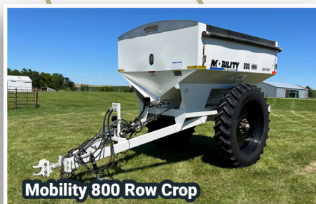
Mobility 800 Row Crop