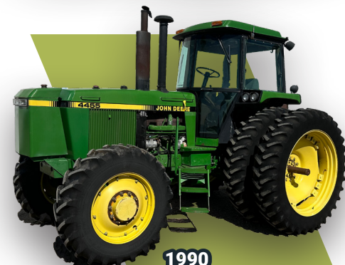
1990 John Deere 4455