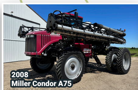
2008 Miller Condor A75