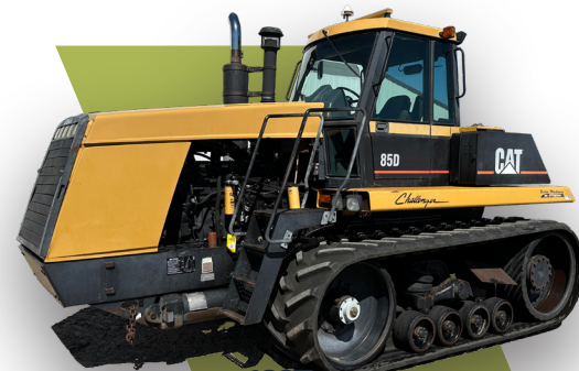
1997 CAT Challenger 85D