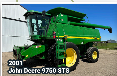
2001 John Deere 9750 STS