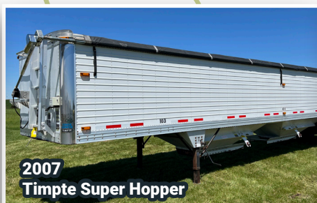
2007 Timpte Super Hopper