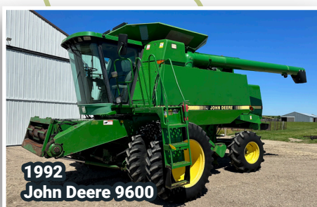
1992 John Deere 9600