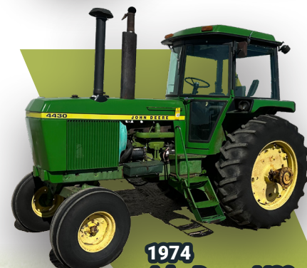
1974 John Deere 4430