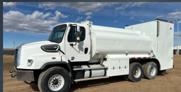
2015 FREIGHTLINER 114SD