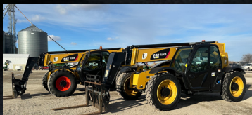
2019 CAT TL943D & 2017 CAT TL943D

Browse more items and see details online!