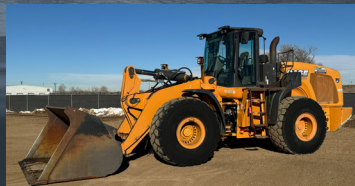
2012 CASE 1021F