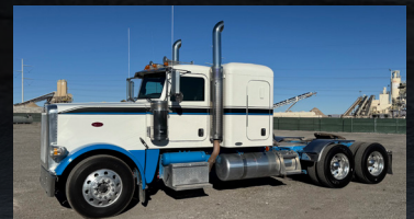
2010 PETERBILT 388