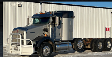
2013 KENWORTH T800