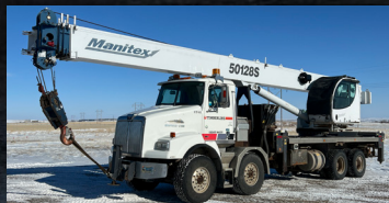
MANITEX ON 2013 WESTERN STAR 4800TS