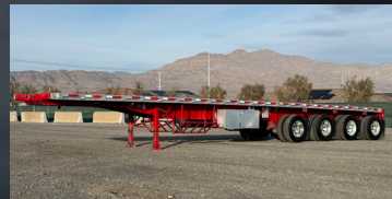
2018 DOONAN SPECIALIZED 4820DBKTFFB