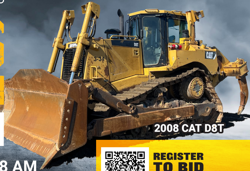
2008 CAT D8T

CLOSING: THURS, MARCH 27 | 11 AM CDT 2025