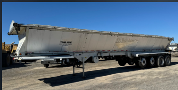
(6) 2005 TRAIL KING RED RIVER SERIES