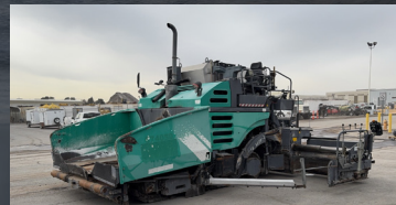
2010 VOGELE SUPER 1800-2