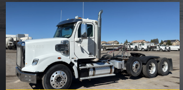
2012 FREIGHTLINER SD CORONADO