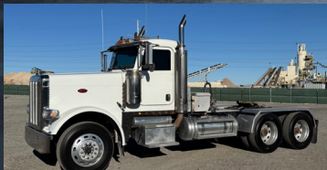
(2) 2009 PETERBILT 388