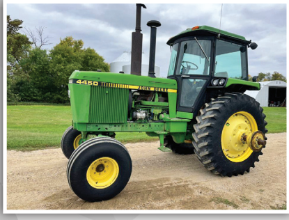
1985 JOHN DEERE 4450 / 9,771 HRS.