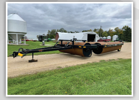
2011 MANDAKO / 45