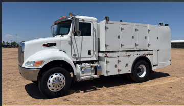
2016 Peterbilt 337