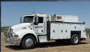
2006 Kenworth T300