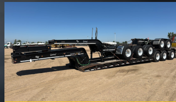
2006 General TAM-7087