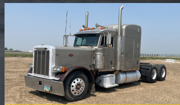
2005 Peterbilt 379