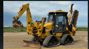
2020 Vermeer RTX 750