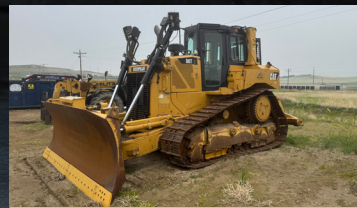
2012 CAT D6T XL