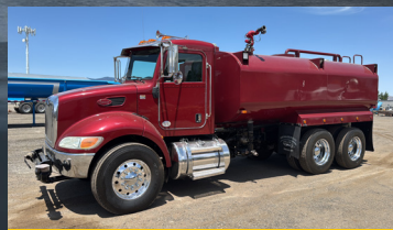
2014 Peterbilt 337