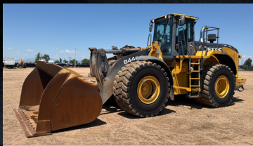
2017 Deere 844K III

Browse more items and see details online!