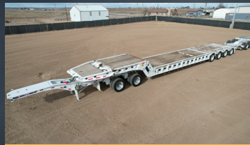
2019 Scona LB70-TRLRSOW-4A