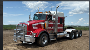
2003 Kenworth T800B