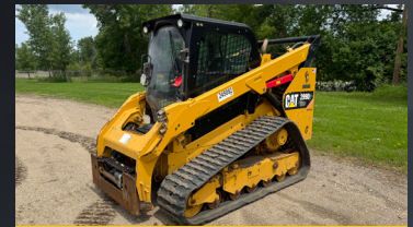
2016 CAT 299D2 XHP