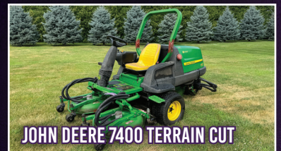
JOHN DEERE 7400 TERRAIN CUT

Visit SteffesGroup.com for complete terms, photos, and lot listings!