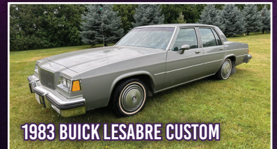
1983 BUICK LESABRE CUSTOM