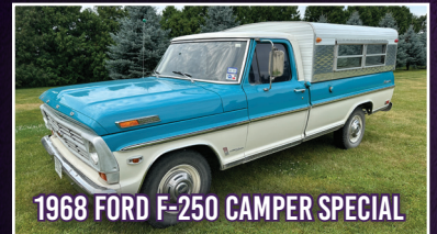
1968 FORD F-250 CAMPER SPECIAL