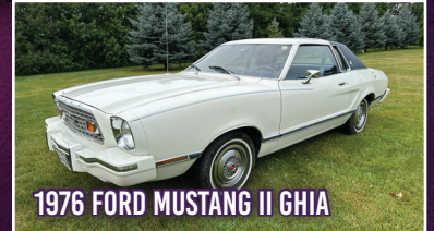
1976 FORD MUSTANG II GHIA

(5) CHEVROLET MODEL CARS , 1958 Impala, 1960 Impala, 1955 Bel Air, 1953 Corvette, 1967 Camaro