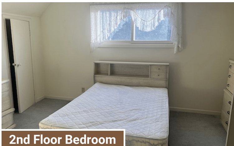
2nd Floor Bedroom