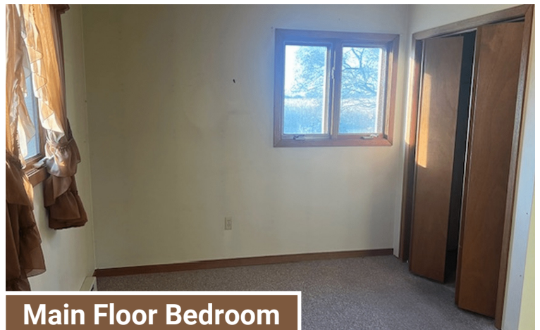
Main Floor Bedroom