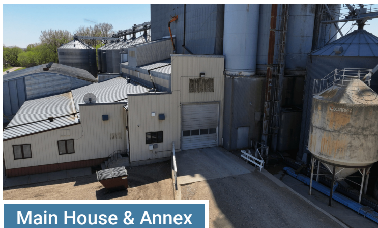
Main House & Annex

Seed Warehouse: 110'x55', concrete floors