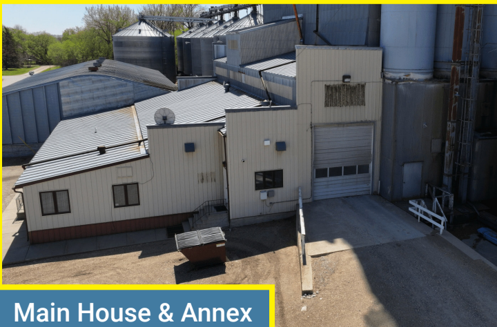
Main House & Annex