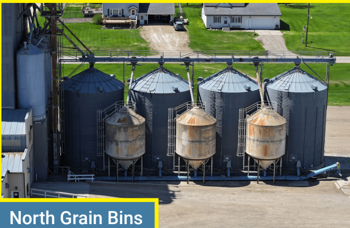
North Grain Bins