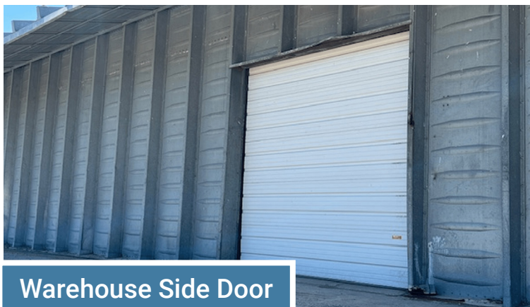
Warehouse Side Door