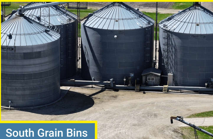
South Grain Bins