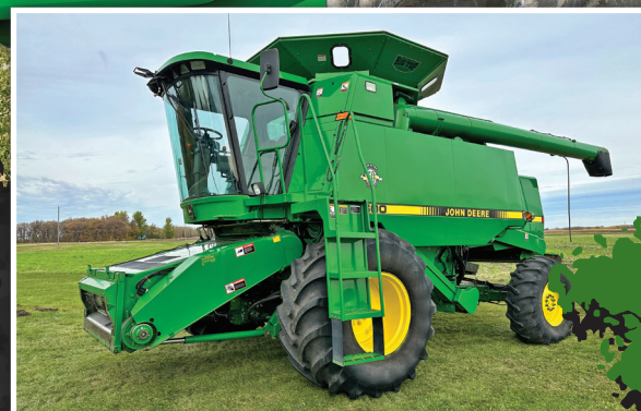
1997 JOHN DEERE 9600

EQUIPMENT PREVIEW: March 13 – March 20 from 8AM-5PM