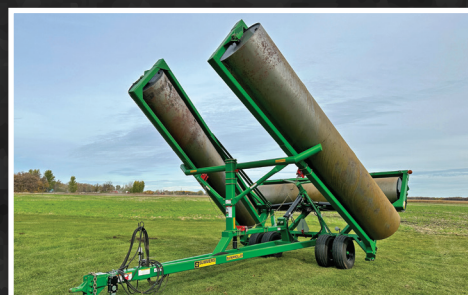
2010 SUMMERS SUPERROLLER