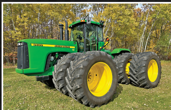
2001 JOHN DEERE 9400