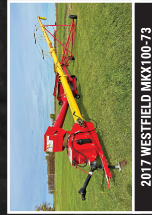
2017 WESTFIELD MKX100-73