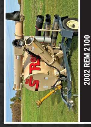
2002 REM 2100