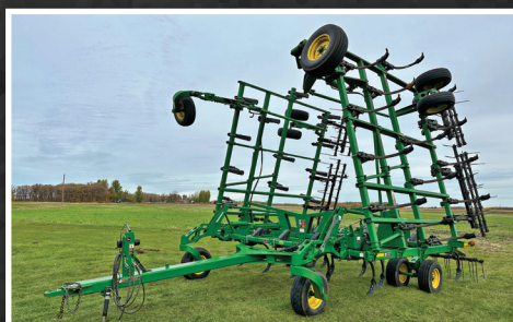
2012 JOHN DEERE 2410