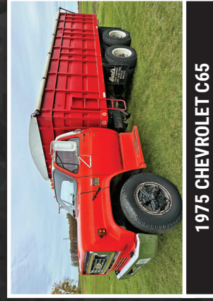
1975 CHEVROLET C65