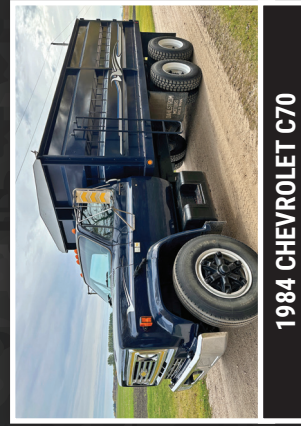
1984 CHEVROLET C70

STEFFES GROUP REPRESENTATIVE JUSTIN RUTH, 701.630.5583 scan QR code to see complete online listing at SteffesGroup.com