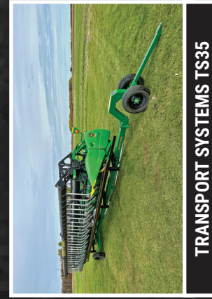
TRANSPORT SYSTEMS TS35