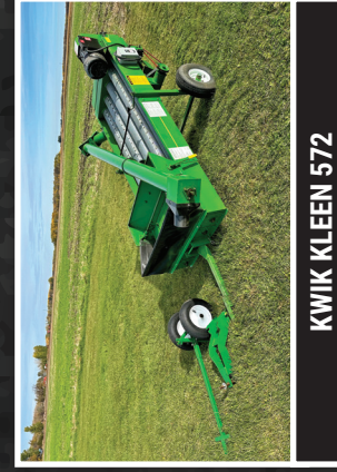
KWIK KLEEN 572