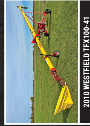
2010 WESTFIELD TFX100-41