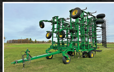
2013 JOHN DEERE 2210