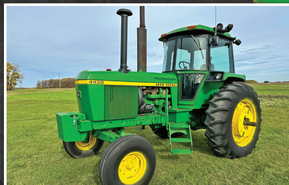
1975 JOHN DEERE 4430