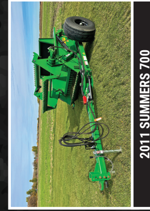
2011 SUMMERS 700