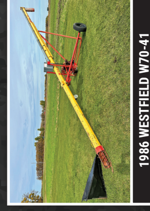
1986 WESTFIELD W70-41