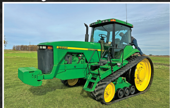
1998 JOHN DEERE 8400T