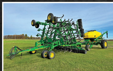
2001 JOHN DEERE 1820