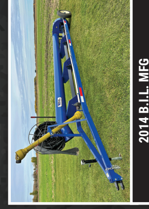
2014 B.I.L. MFG