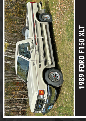
1989 FORD F150 XLT