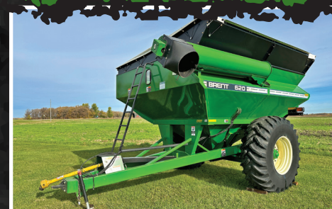
2003 BRENT 620