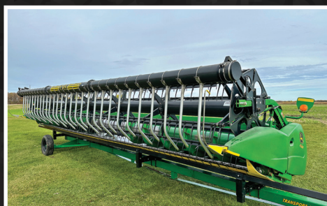
2011 JOHN DEERE 630F HYDRAXFLEX

EQUIPMENT PREVIEW: March 13 – March 20 from 8AM-5PM