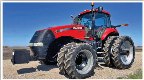
2011 CASE IH MAGNUM 290