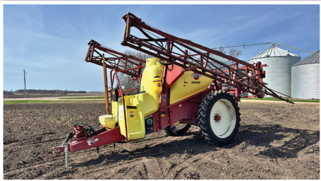
HARDI NAVIGATOR 1100