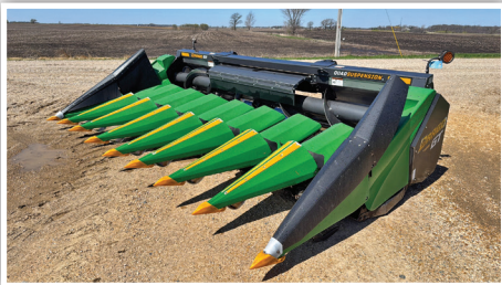
2017 DRAGO 8-22