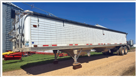
1999 TIMPTE SUPER HOPPER