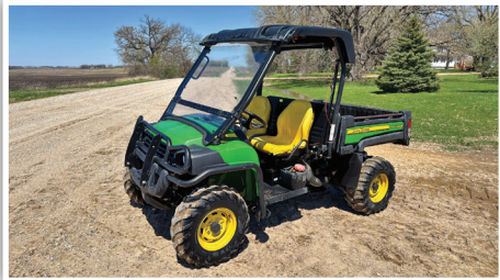
2012 JOHN DERE GATOR XUV 855D