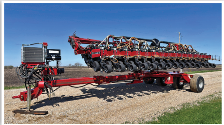
CASE IH 1200