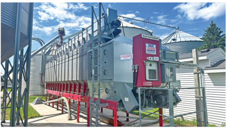
2014 BROCK SUPERB SQ28