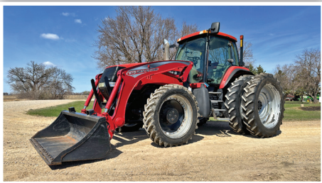
2005 CASE IH MX230