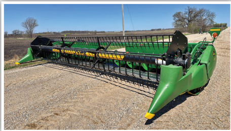
2009 JOHN DEERE 625F