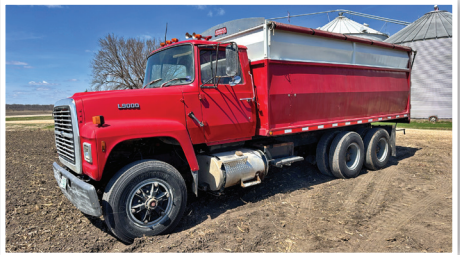
1987 FORD L9000