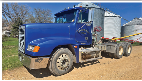
1999 FREIGHTLINER FLD120