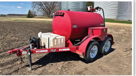
2012 LEEAGRA 475-DT