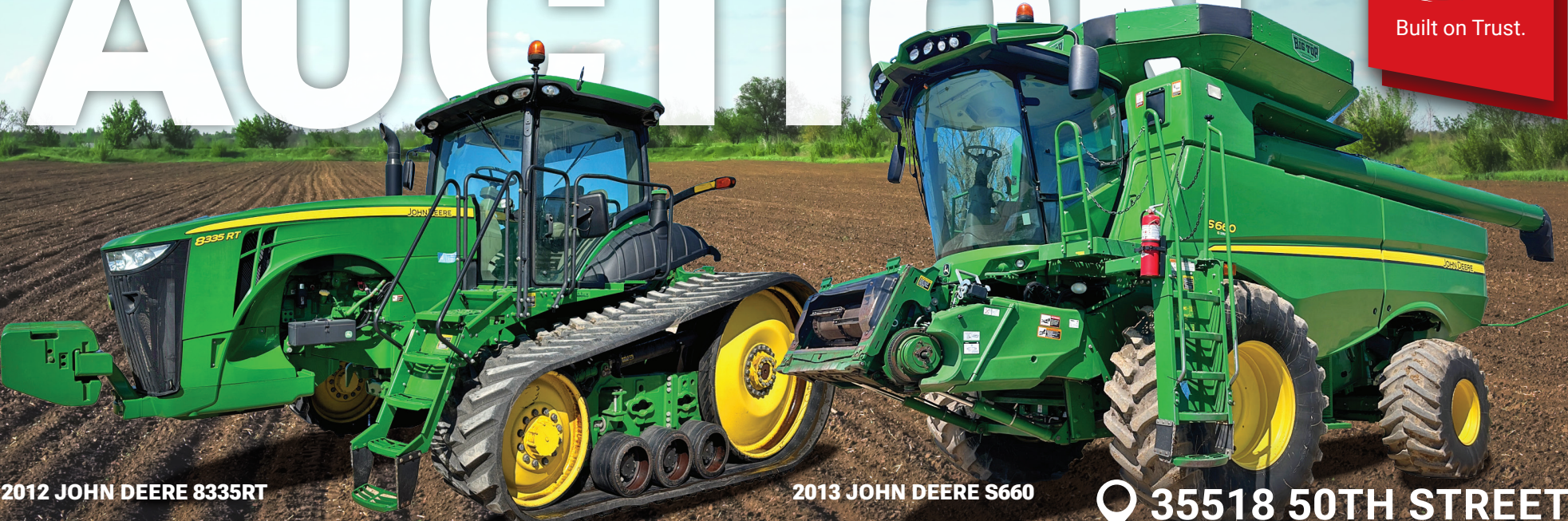
2012 JOHN DEERE 8335RT