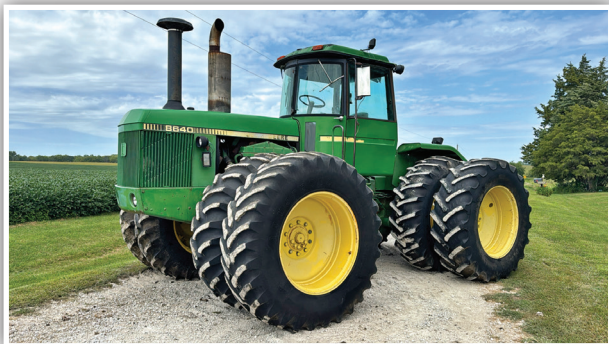
1980 JOHN DEERE 8640

CLOSING: TUESDAY, DECEMBER 9 | 11AM CST 2025