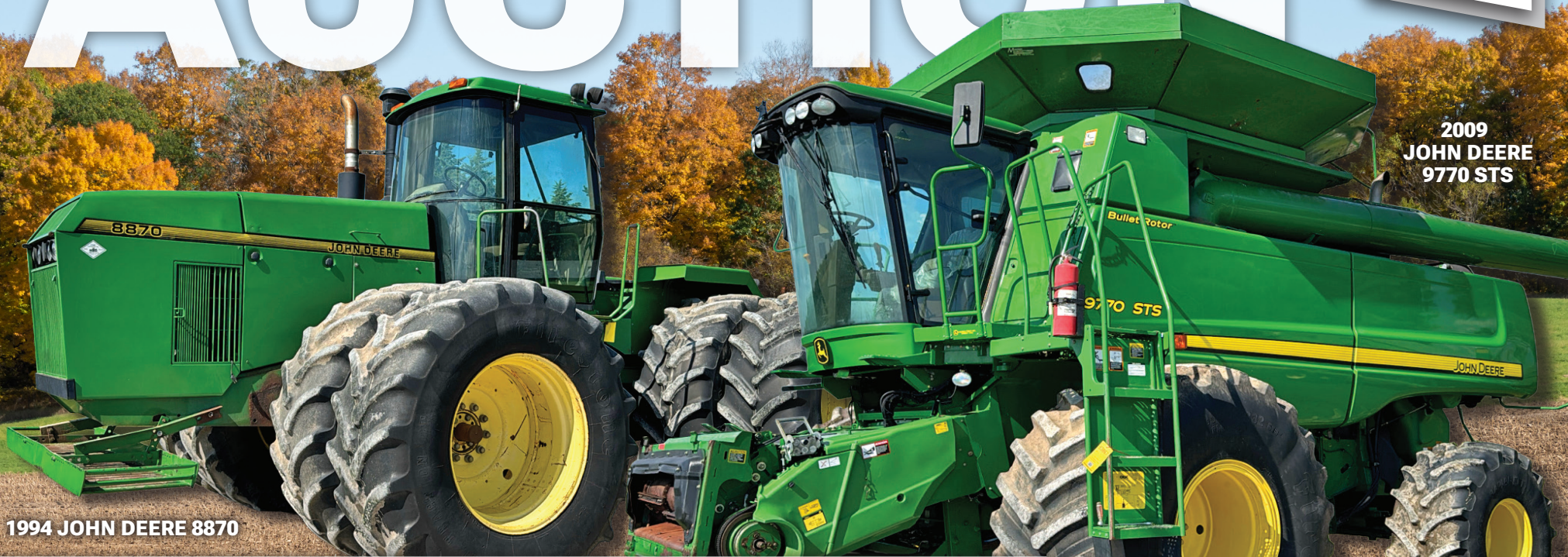
1994 JOHN DEERE 8870