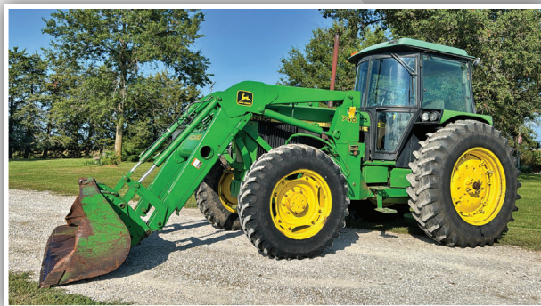
1990 JOHN DEERE 3155