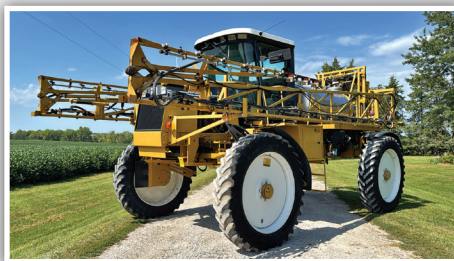
2000 ROGATOR 854