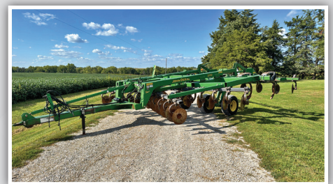
JOHN DEERE 2700