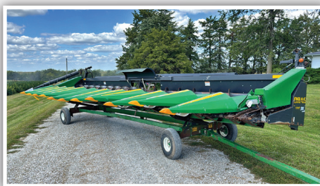
2013 DRAGO N12