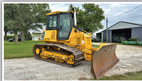
2014 KOMATSU D51PXI-22