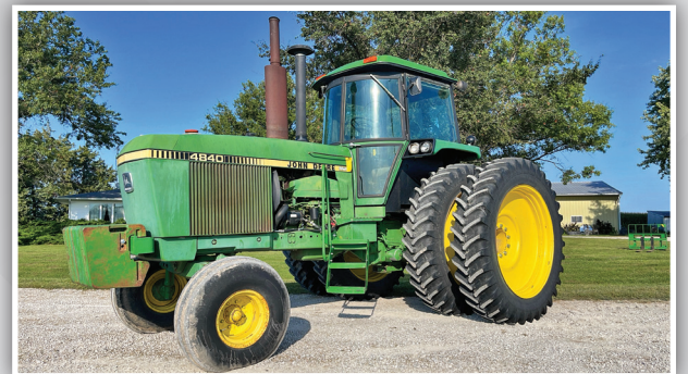
1980 JOHN DEERE 4840