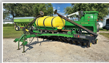
JOHN DEERE 750