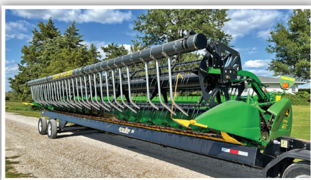
2006 JOHN DEERE 635F