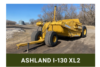
2007 TRACKER MFG TRL