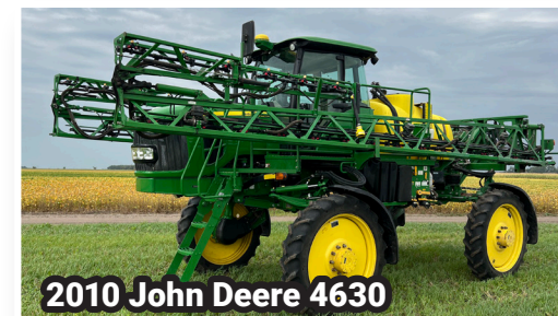
2010 John Deere 4630