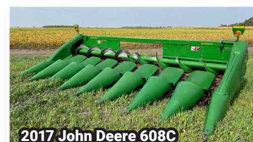
2017 John Deere 608C