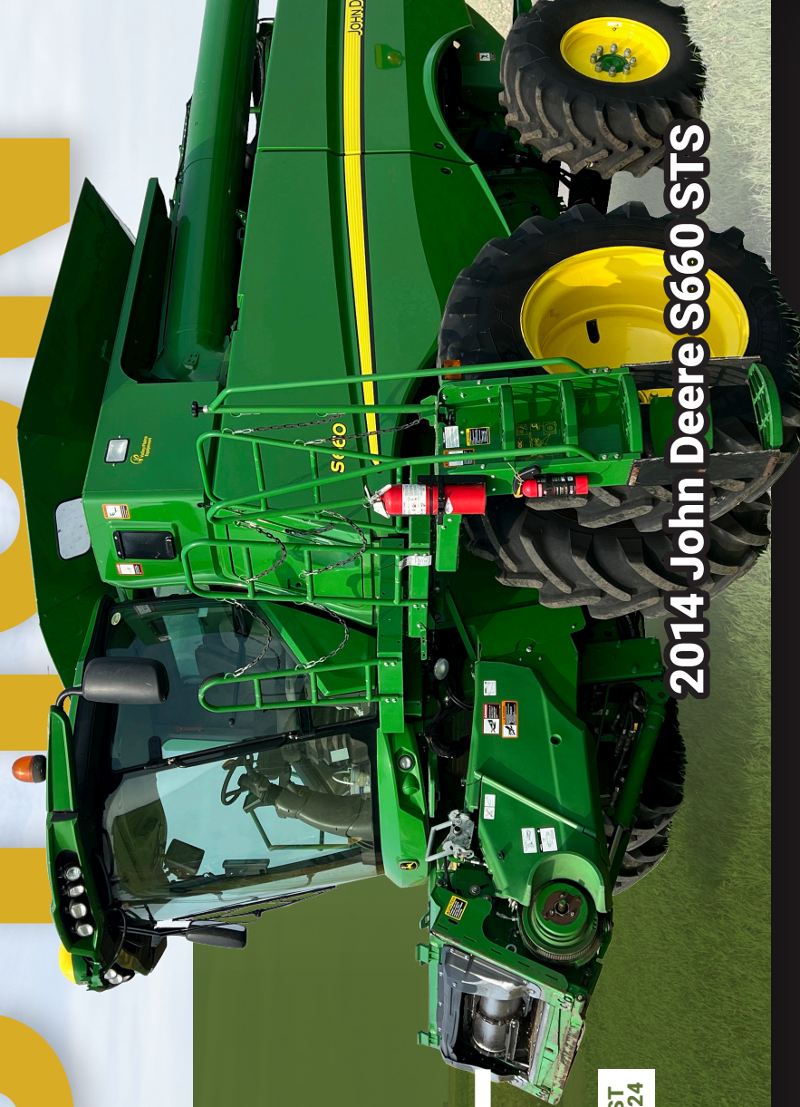
2014 John Deere S660 STS