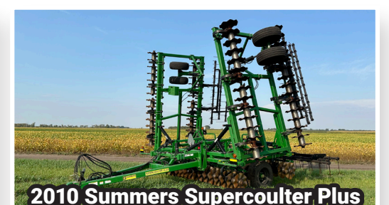
2010 Summers Supercoultter Plus