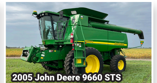
2005 John Deere 9660 STS