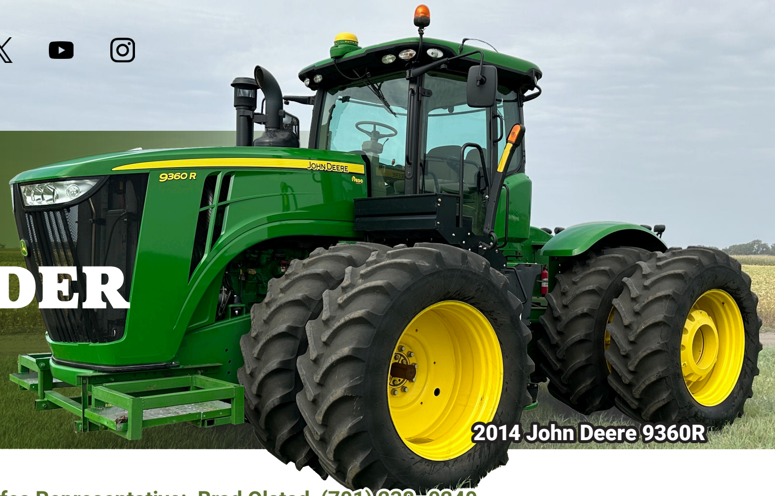
2014 John Deere 9360R