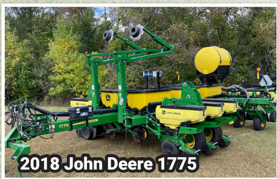
2018 John Deere 1775