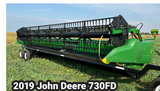
2019 John Deere 730FD