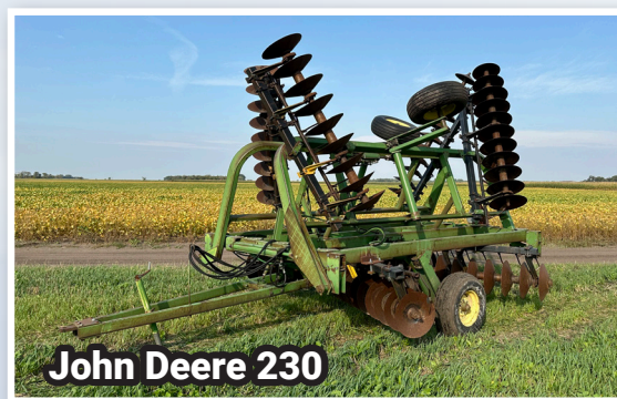
John Deere 230

Water Master floating water pump, Kohler XT Series, 7-3/4 hp., 6", w/lay flat hose Sickle bar section sharpener, 110v, on stand