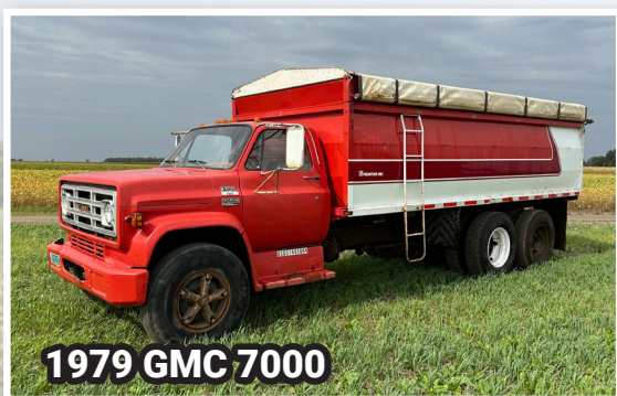
1979 GMC 7000