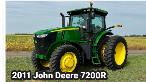
2011 John Deere 7200R

(2) Blumhardt Mfg. 235 gal. poly tanks front-mount saddle tanks, on frame