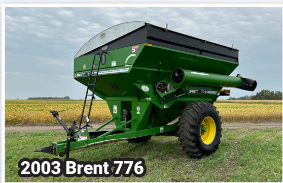
2003 Brent 776