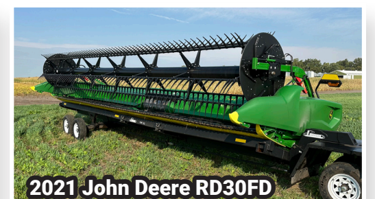
2021 John Deere RD30FD