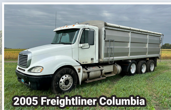
2005 Freightliner Columbia