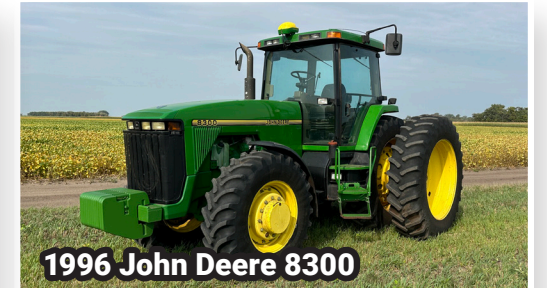
1996 John Deere 8300