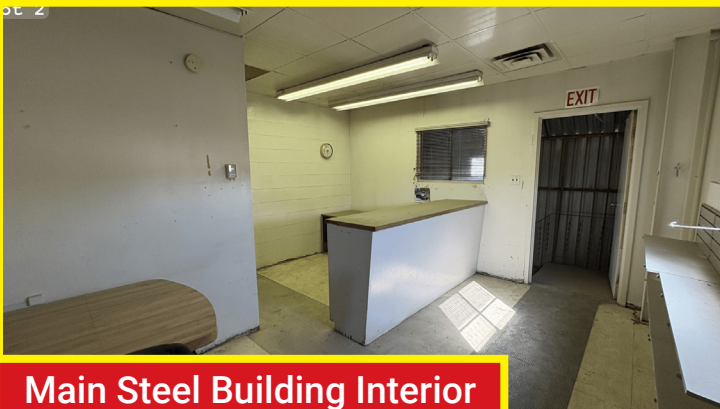
Main Steel Building Interior