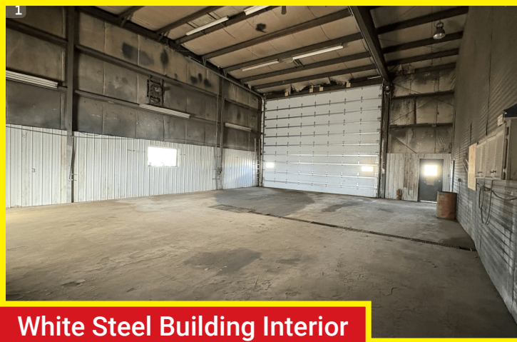
White Steel Building Interior