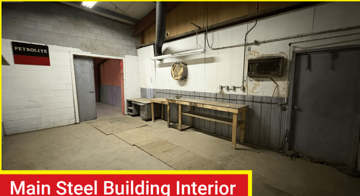
Main Steel Building Interior