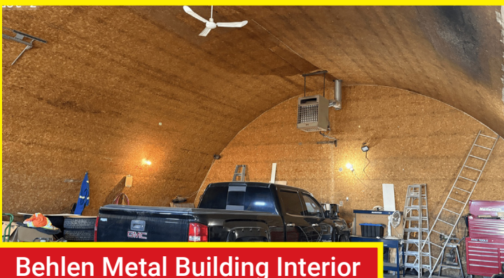
Behlen Metal Building Interior