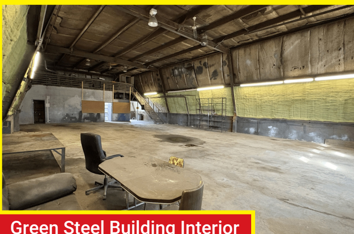
Green Steel Building Interior