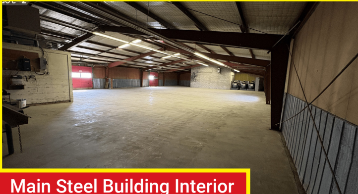
Main Steel Building Interior