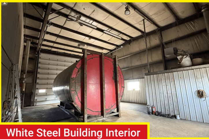
White Steel Building Interior