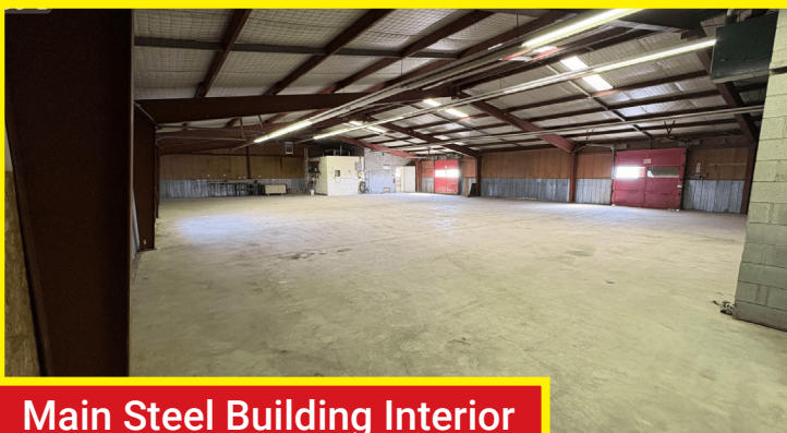
Main Steel Building Interior